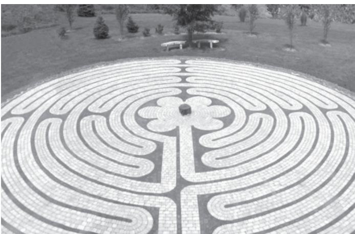
Walking on the brick-inlaid, outdoor labyrinth is an alternative way to pray and meditate.