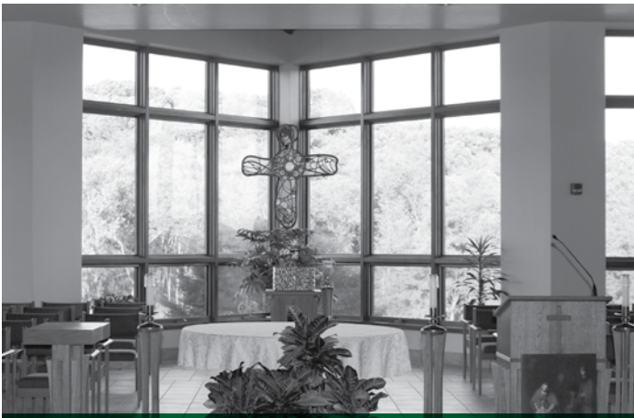
Visitation Chapel offers quiet solitude 24/7 and seating for up to 200 guests.