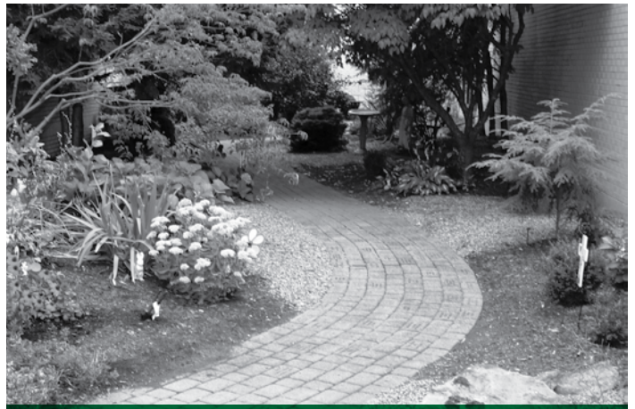
The beautiful grounds include a meditation garden, gazebo and woodland reflection trail.