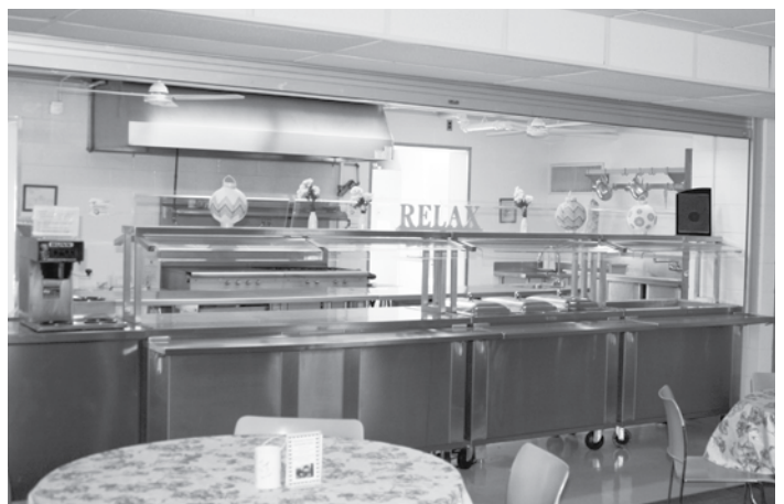
The accessible kitchen and dining room are fully equipped with seating for up to 70 guests.