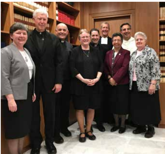
Several of the visits were made jointly with the CMSM delegation