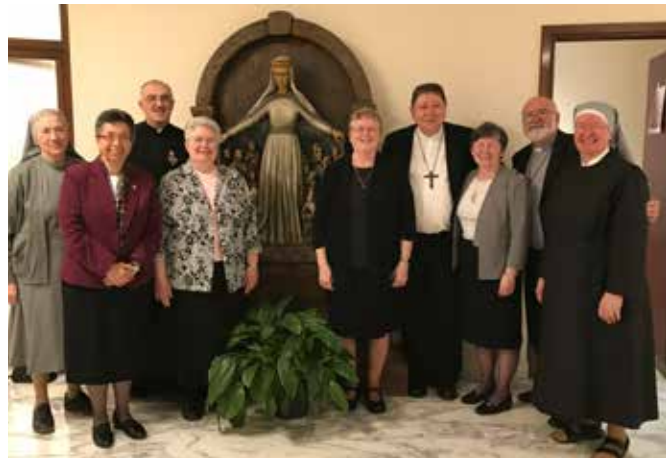
LCWR meets with the staff of the Congregation for Institutes of Consecrated Life and Societies of Apostolic Life