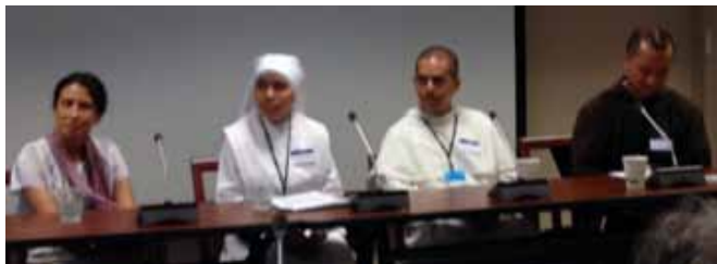
Panel of newer women and men religious from diverse cultures at the NRVC symposium.

The symposium also included input from newer religious from cultures outside of the United States on their personal experiences of formation and integration. Symposium participants also shared their own best practices, as well as insights into the challenges of intercultural religious life, particularly the challenges noted in the study of some unwillingness to change to accommodate other cultures on the part of professed members of the congregation and the aging of US religious congregations.