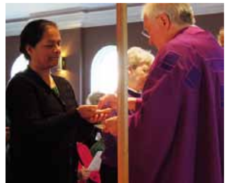
Prayer, reflection, and a Eucharistic liturgy were integral to the workshop

More than 100 LCWR members gathered from March 19-22 at the University of St. Mary of the Lake Con- ference Center in Mundelein, Illinois for the LCWR New Leader Workshop.