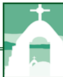
Room at the Inn

Retreat Ministry ◆ Kearns Spirituality Center ◆ Providence Villa