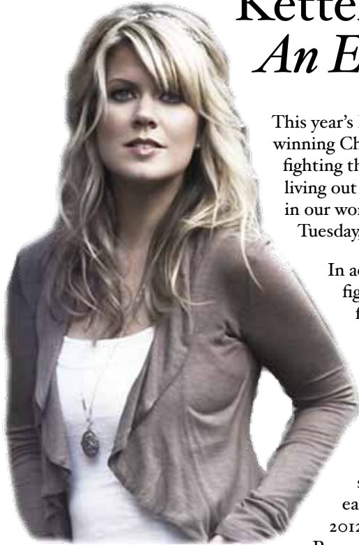
Natalie Grant Abolition International

This year's Bishop Ketteler Award for Social Justice will be presented to award-winning Christian singer and activist Natalie Grant for her passionate commitment to fighting the atrocities of human trafficking and the child sex trade, her dedication to living out her faith, and her commitment to making God's providence more visible in our world. She will be presented the award at a reception and dinner event on Tuesday, October 23, at Shannopin Country Club, Ben Avon Heights in Pittsburgh.