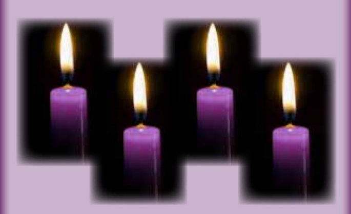
Foruth Sunday of Advent, December 18